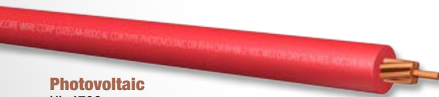
Photovoltaic UL 4703 Aluminum available in 8 AWG or larger