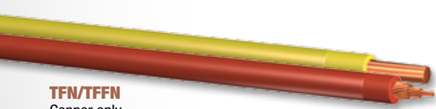
TFN/TFFN Copper only