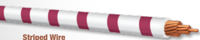
Striped Wire Available on any single conductor wire type