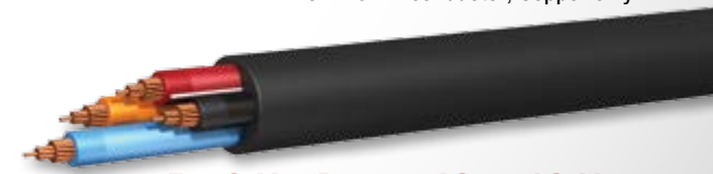
Tray Cable - Power and Control Cable - with or without Ground - THHN/XHHW-2/RW90 Inners Copper conductors available in 14 AWG-2 through 750 KCMIL-4, Aluminum conductors available in 6 AWG and larger