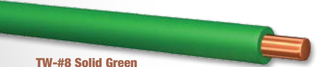
TW-#8 Solid Green