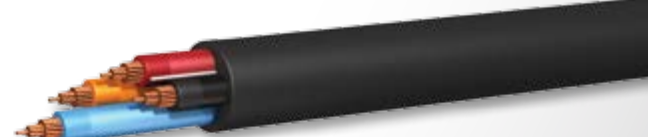
Tray Cable - Power and Control Cable - with or without Ground - THHN/XHHW-2/RW90 Inners Copper conductors available in 14 AWG-2 through 750 KCMIL-4, Aluminum conductors available in 6 AWG and larger