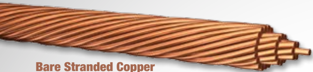
Bare Stranded Copper