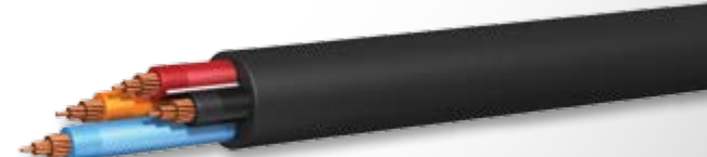
Tray Cable - Power and Control Cable - with or without Ground - THHN/XHHW-2/RW90 Inners Copper conductors available in 14 AWG-2 through 750 KCMIL-4, Aluminum conductors available in 6 AWG and larger